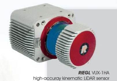
high-accuray kinematic LiDAR sensor

Seamless RIEGL workflow for MLS data acquisition, processing and adjustment is provided by RIEGL's proven software suite.