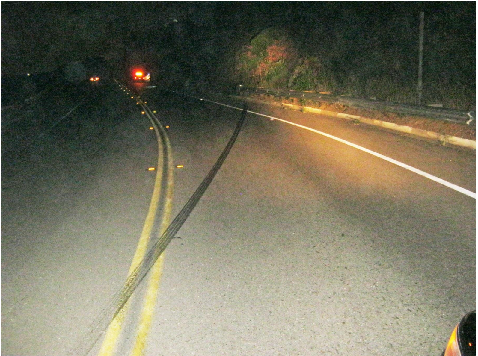
San Diego PD image